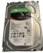
Seagate IronWolf Pro